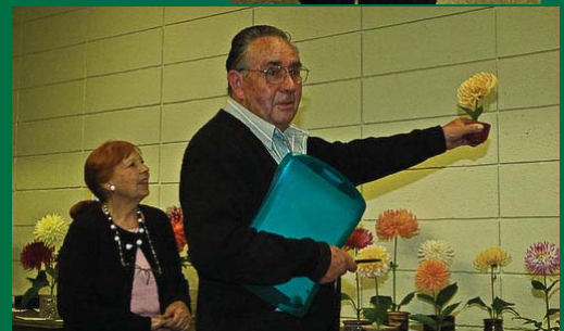
photos for Novice Only Mini Show