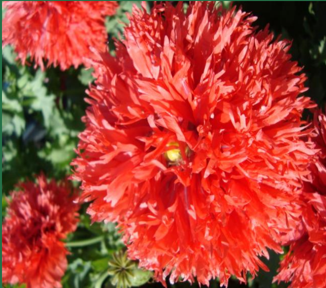
Double Laciniated Poppies