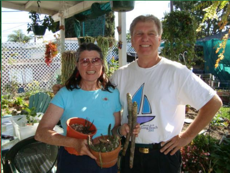
Collecting ceropegia stabiliformes , cactus & plumeria