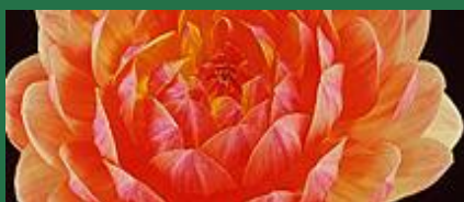
PAM HOWDEN Form: Waterlily