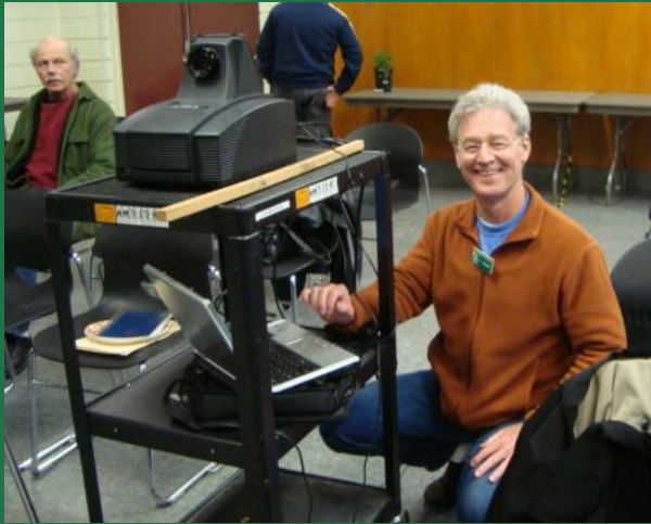
DJ deploys his mighty power point