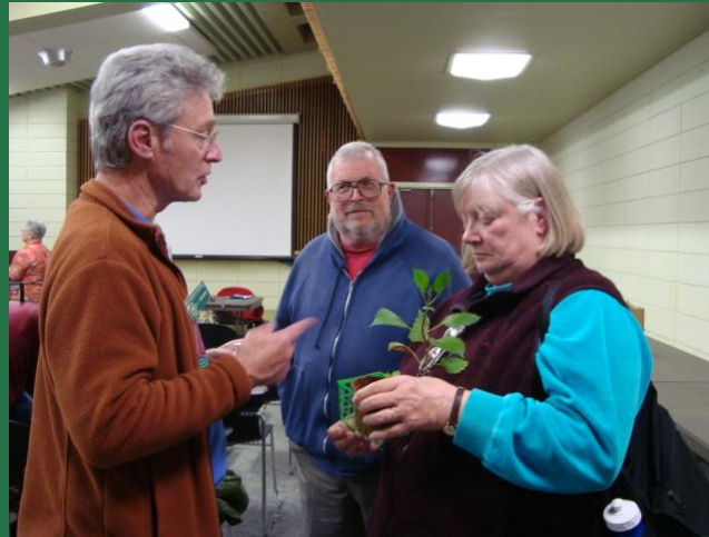
DJ exhorts xxx and Don to do more