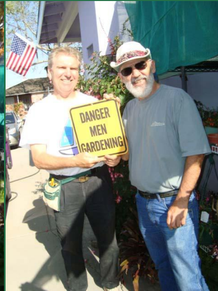
DANGER MEN GARDENING