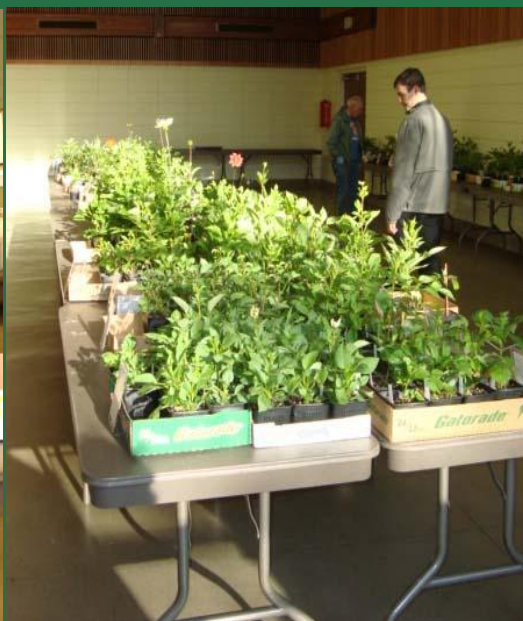
Blooming Cuttings? !