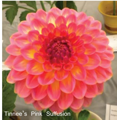
Tinnee's Pink Suffusion