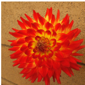
Lou's first year seedling