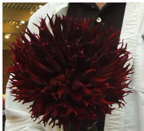
Kenora Malcop B