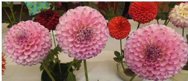
Hilltop Glow 3010