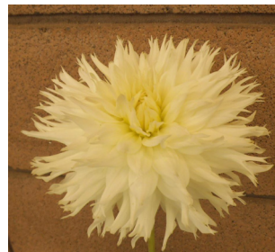
Woodland's Seraphina 3501