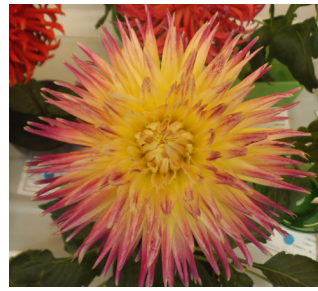
Trelyn Rianon 2313