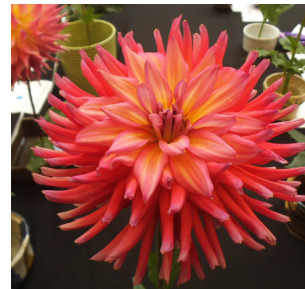
DJ's first year seedling