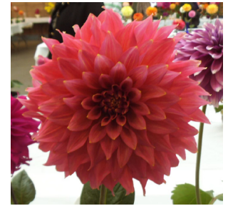
Wyoming Wedding 3105