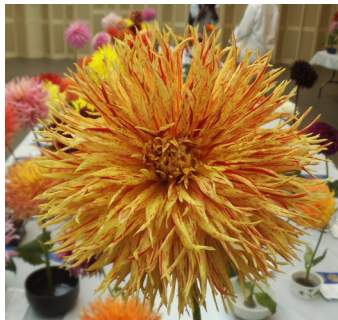
Rejeman's Firecracker 2514