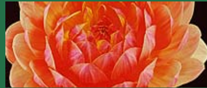
PAM HOWDEN Form: Waterlily