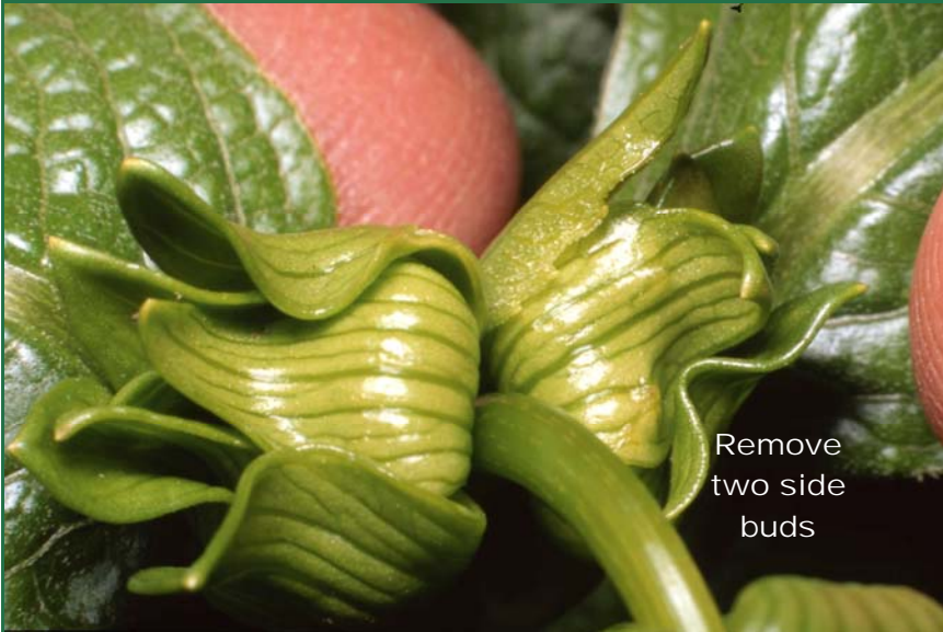
Remove two side buds

At last! First blooms appear. One of the hardest chores is pinching out the first bud. Usually the first bud will appear with two smaller buds at the sides and a pair of leaves. Pinch out all three buds and both leaves down to the stem to where the next set of leaves appears. Pinching (or stopping in dahlia lingo) sends all that energy that would have gone into the first flowers back into making a stronger, heartier plant. Your dahlia will be bushier and better shaped. Were you to leave the bud on, probably the bloom would be very crotch bound on a short stem. When you get your second flush of buds, disbud the two flanking buds leaving only the central, biggest bud to flourish. This yields a significantly larger bloom on a