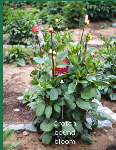
Crotch bound bloom

longer, stronger stem. Truly. When it comes time to harvest your bloom (or deadhead when the bloom is spent) pay careful attention to where you cut it off. You want to go beneath the two leaves which accompany your bloom down to NEW GROWTH. If you just cut off the flower before its accompanying two leaves, you will have brown scraggy plants by August.