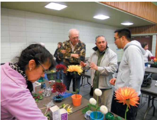
DSC show entry tags