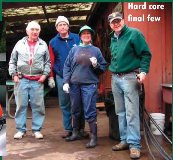
Hard core final few