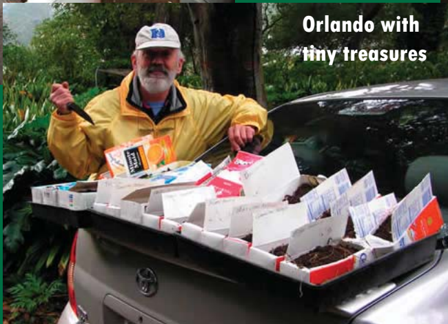
Orlando with tiny treasures