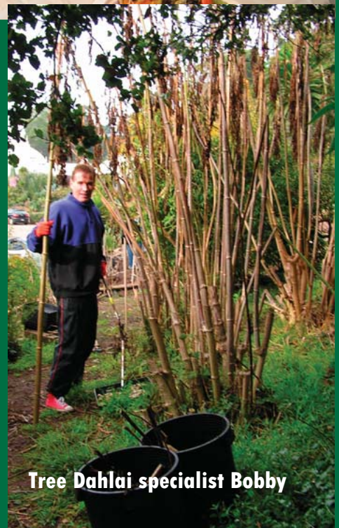
Tree Dahlai specialist Bobby

More DIGOUT 2010 Kodak moments Click here for even more DIGOUT 2010 photos