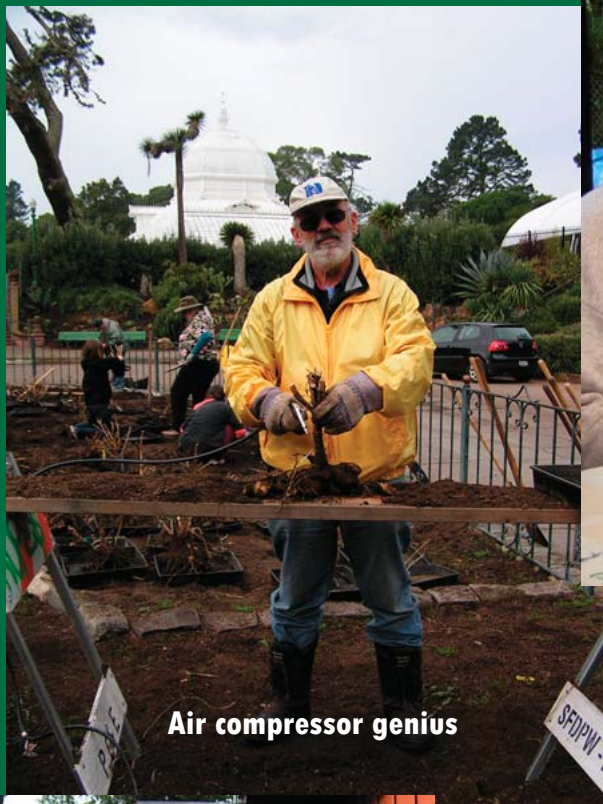
Air compressor genius