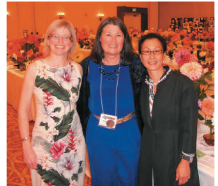
original Hillside Girls