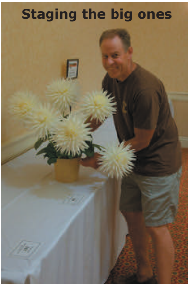
Staging the big ones