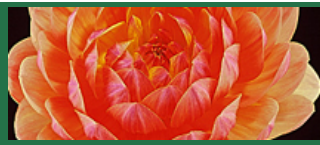
PAM HOWDEN Form: Waterlily