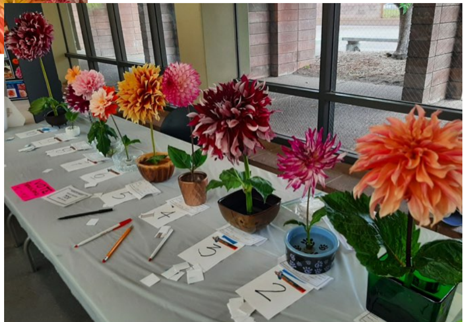
Photo Op Spots. They took lots of pix and posted them, inviting friends to drop by our show too. Having the massive photo opportunities outside kept the traffic flowing much

such a thing as too much publicity? What a line awaited the 10 am opening to the public! So many people thronged to see our beautiful dahlias, but not before stopping at Jenna's three