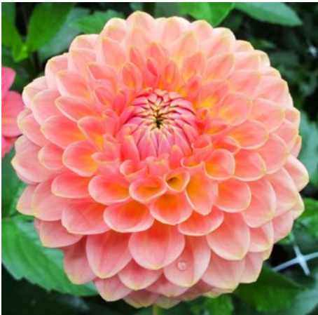
20th Ave Softer Peach