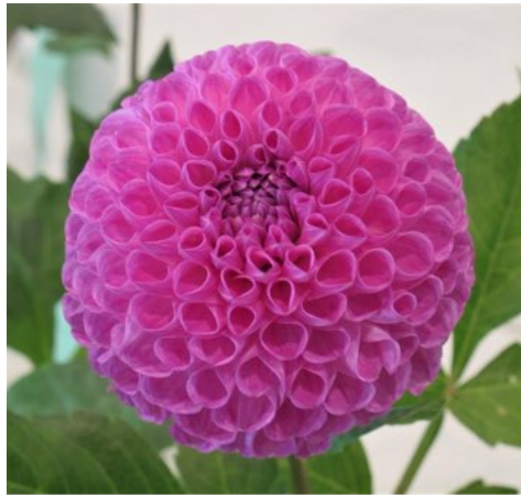
20th Ave Morning Mist