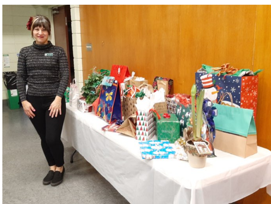
party. So fun.