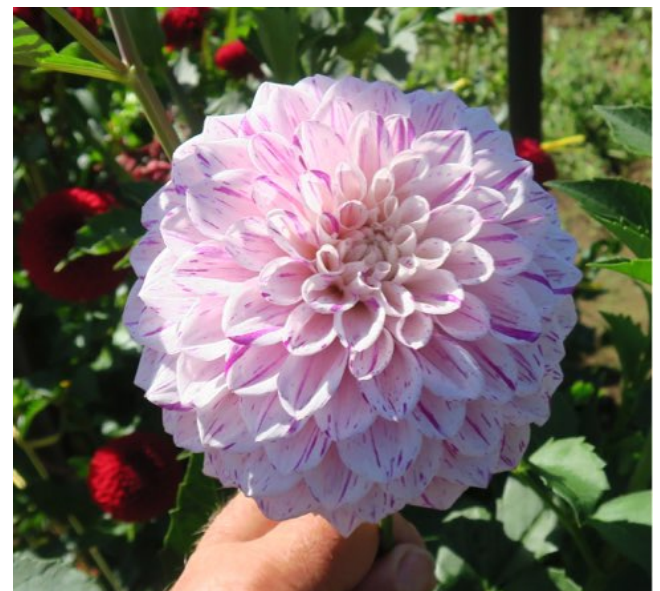
Hollyhill Finger Paint